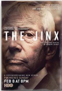
The Jinx: E1 Ch1