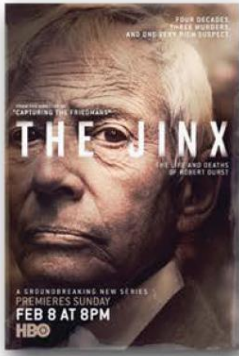
The Jinx : E1 Ch1 The Life and Deaths of Robert Durst